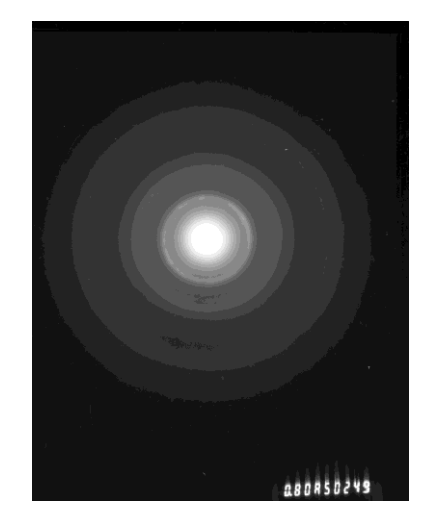
Figure 2 TEM and TED images of gold nanoparticles supported on undoped MWCNTs.

Single acid-treated MWCNTs (without ionic liquids treatment) were also mixed with gold colloid, and no gold nanoparticles were found on the nanotubes. This indicates that ionic liquid acts as a bridge to connect gold nanoparticles with MWCNTs nanotubes. Subsequent treatment with ionic liquids at room temperature and exposure to negatively charged gold nanoparticles showed that the carboxyl functional groups were present at the ends of the nanotubes. So it acts as an excellent method for monitoring the presence of carboxyl chemical groups on the surfaces of nanotubes [14].