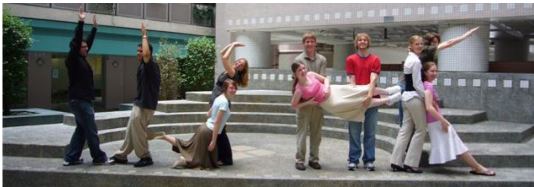
REU 香港站的第二批07年学生 REU 2007 students in Hong Kong

年一度的乘船巡游香港是由香港中文大学计算机科学与工程系的蒙耀生教授组织的。蒙教授研究小组的学生们也参与了这些充满欢乐的游船活动。