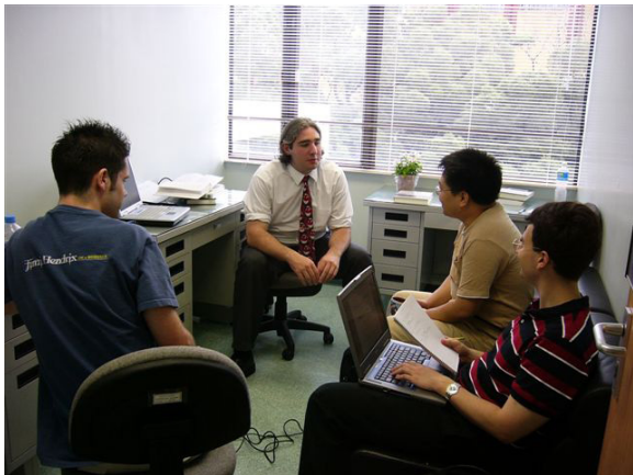
REU 学生在办公室里和当地学生讨论问题 REU students communicated with local student

在每届REU活动结束的时候，那些参加的学生们要完成一个书面的调查报告，这份调查引用文献[10]即《项目主任手册：大学生国际研究经验的成功范例》中的问卷，包括大约50个问题，是专门为评价下面几个问题设计的：(1)活动的组织质量；(2)学习环境；(3)学生学习的质量；(4)学术资源和学生资助；(5)活动的管理。每一位做研究顾问的老师也要完成一份书面的调查